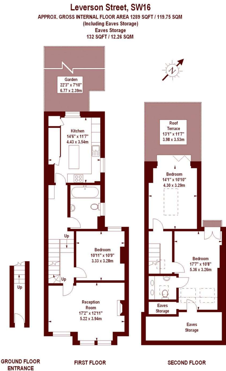
Illustration For Identification Purposes Only. Not To Scale *Floorplan Drawn According To RICS Guidelines Copyright of FeaturePRO

All viewings by appointment through our TOOTING office: