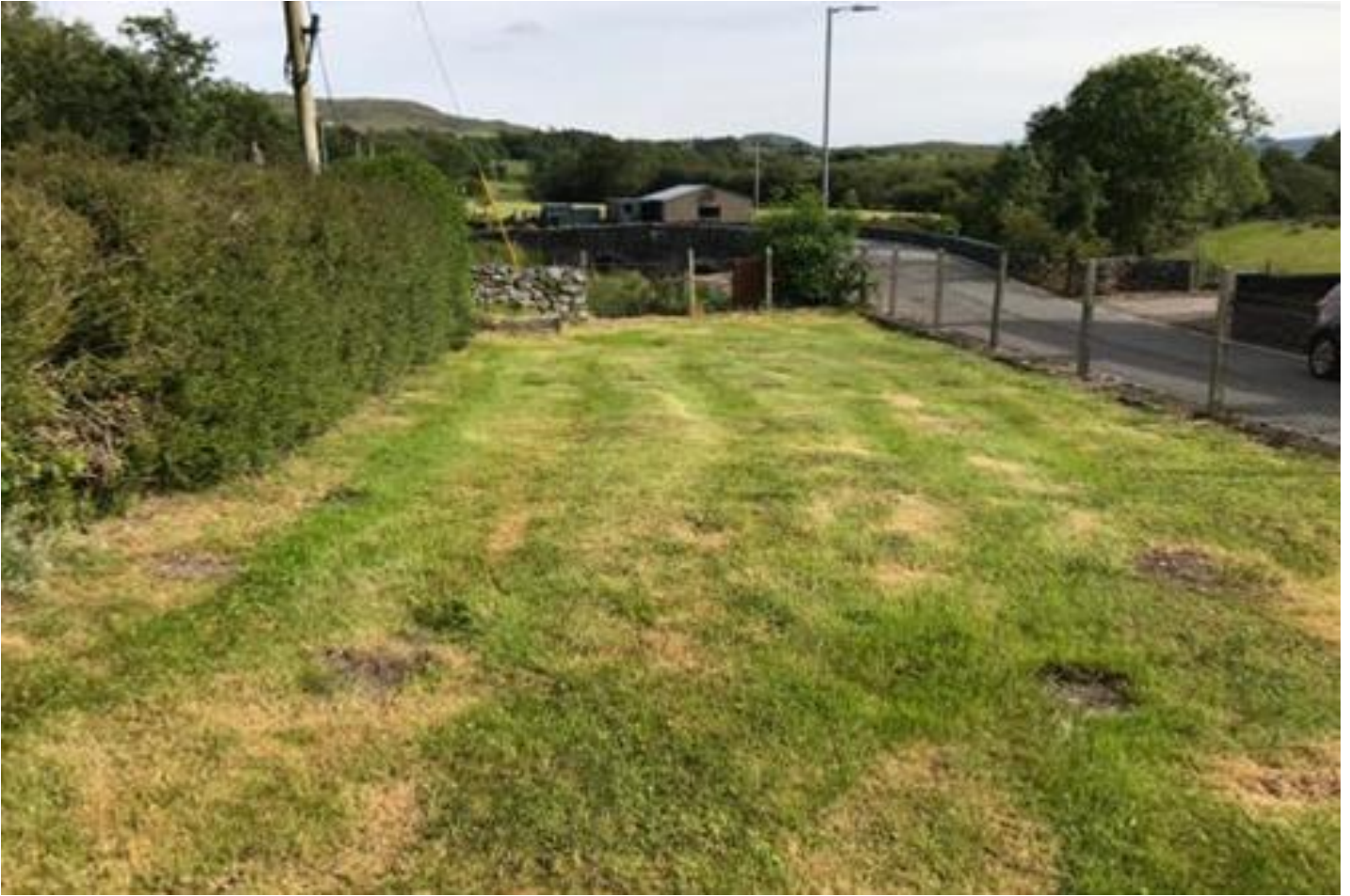
Land at Maesgwyndy, Maes Gwyndy, Trawsfynydd, Blaenau Ffestiniog LL41 4SR • Guide Price £5,000