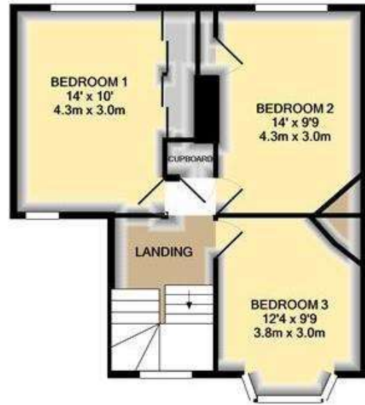
1ST FLOOR APPROX. FLOOR AREA 498 SQ.FT. (46.2 SQ.M.)

TOTAL APPROX. FLOOR AREA 1077 SQ.FT. (100.1 SQ.M.)