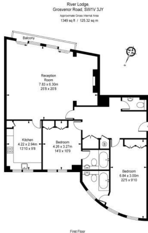
ILLUSTRATION FOR IDENTIFICATION PURPOSES ONLY ALL MEASUREMENTS ARE MAXIMUM AND INCLUDE WINDOW BAYS AND WARDROBES WHERE APPLICABLE THIS PLAN MUST NOT BE REPRODUCED BY ANY OTHER PERSON WITHOUT PERMISSION