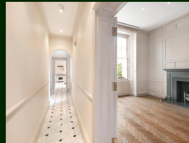
Flat 2, 1-2 Wilton Terrace, SW1 Gross Internal Area : 215.3 sq.m (2317 sq.ft.) (Excluding Terrace & Plant Room)