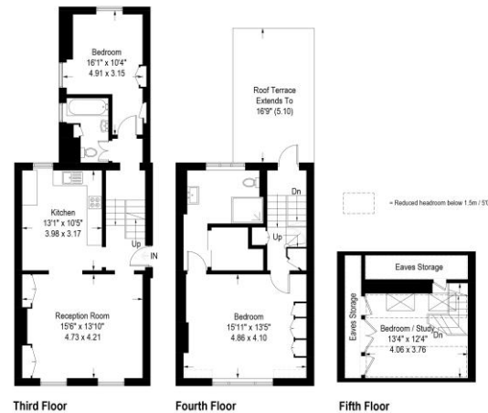
Illustration for identification purposes only. measurements are approximate, not to scale. (ID501842)