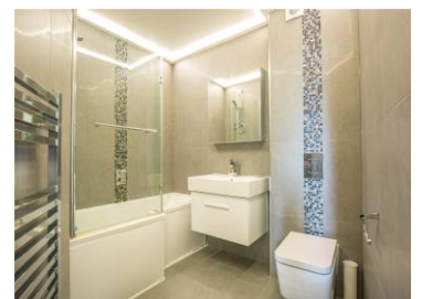
Three double bedroom chalet style bungalow with open plan living area.