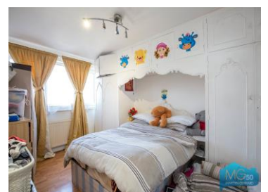
A two bedroom purpose built flat in the middle of Finchley Central.