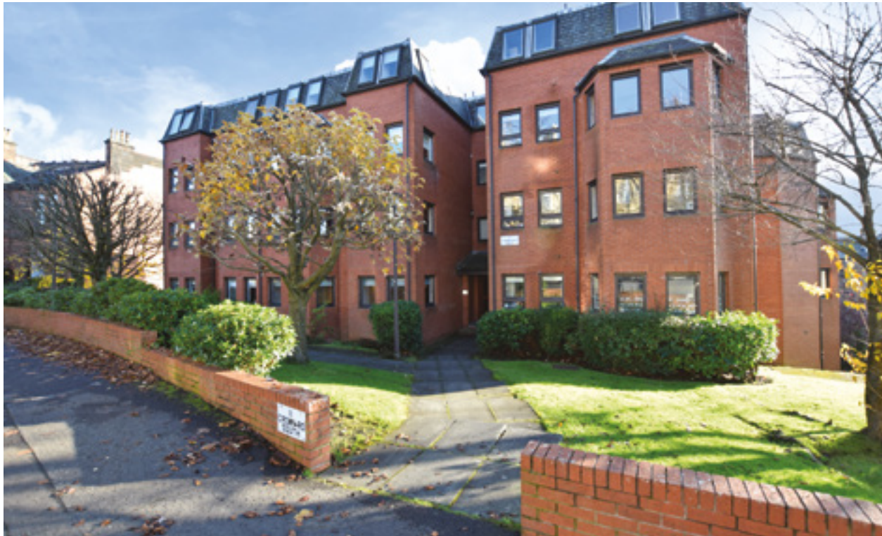
1 CROWN ROAD SOUTH DOWANHILL