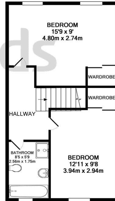
2ND FLOOR APPROX. FLOOR AREA 438 SQ.FT. (40.7 SQ.M.)

TOTAL APPROX. FLOOR AREA 1441 SQ.FT. (133.9 SQ.M.)